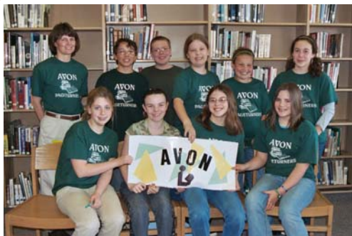
Many teams create personalized PageTurners t-shirts.

Check our website for the schedule of competitions, there's one near you!